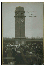
ROMANBY WAR MEMORIAL UNVEILING Saturday March 19 th 1927