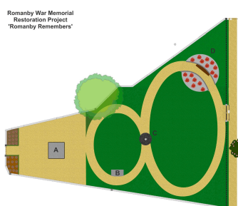
ROMANBY WAR MEMORIAL GARDEN PLAN 2014

The “Romanby Remembers” project was launched by the Parish Council in 2014, with the main focus of improving the public open space that is the Romanby Memorial Garden and developing resources and archive materials for all residents about the Memorial, and the men commemorated, including their lives and families. Residents were consulted and helped with the design of the gardens, including layout, new paths, access and planting, and the final design was publicly approved in 2015, when work began, with help from both the Heritage Lottery Fund, and the North East Horticultural Society.