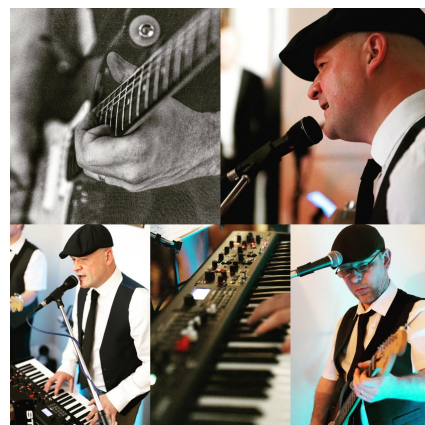
THE BLACK MARCS