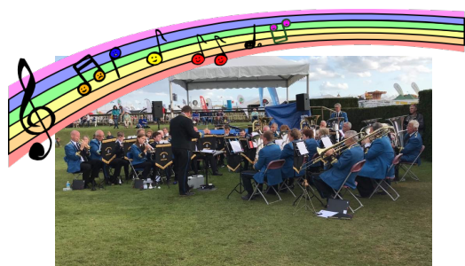
The Northallerton Silver Band