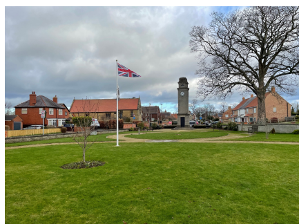
ROMANBY PARISH COUNCIL THE QUEEN ELIZABETH II PLATINUM JUBILEE FLAGPOLE DEDICATED ON 2 ND JUNE 2022

The “Romanby Remembers” project was launched by the Parish Council in 2014, with the main focus of improving the public open space that is the Romanby Memorial Garden and developing resources and archive materials for all residents about the Memorial, and the men commemorated, including their lives and families. Residents were consulted and helped with the design of the gardens, including layout, new paths, access and planting, and the final design was publicly approved in 2015, when work began, with help from both the Heritage Lottery Fund, and the North East Horticultural Society.